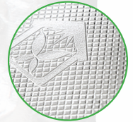
Silver coated metallised UltraLux film - durable and highly reflective