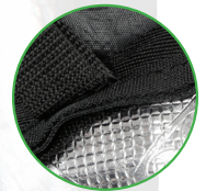
Woven Polyamide (PA) extremely strong - 210 Denier

All apertures feature draw strings and are double lined for light-proofing with 360 degree passive air vents with mite-proof netting to offer uniform distribution of air flow.